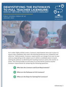
Teacher Licensure Pathways Focus Group Report