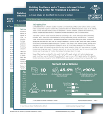
Resilience & Learning Case Studies