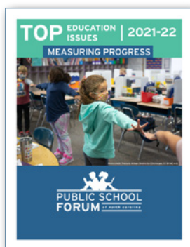
Top Education Issues