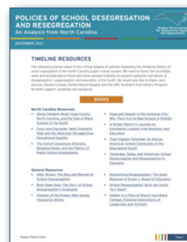
NC School Desegregation & Resegregation Timeline