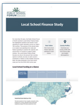
Local School Finance Study