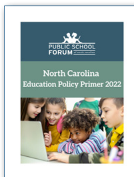
Education Policy Primer